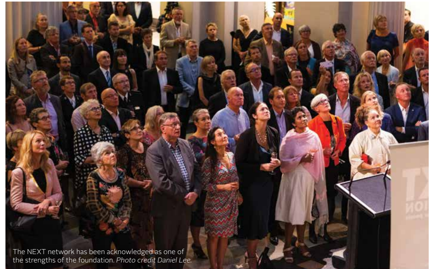
The NEXT network has been acknowledged as one of the strengths of the foundation.