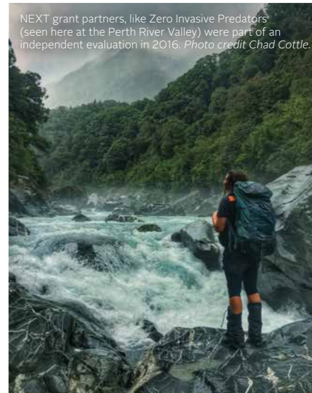
NEXT grant partners, like Zero Invasive Predators (seen here at the Perth River Valley) were part of an independent evaluation in 2016.