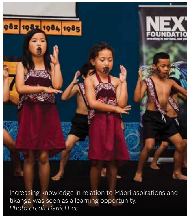
Increasing knowledge in relation to Māori aspirations and tikanga was seen as a learning opportunity.

Grant partners were asked to describe what learning areas existed for NEXT, and opportunities to improve. There were various learning areas such as increasing knowledge in relation to Māori aspirations and tikanga; further leveraging the 'big minds' and networks of NEXT; and increasing lobbying with the Ministry of Education.